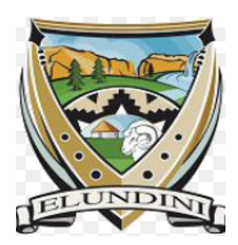
ELUNDINI LOCAL MUNICIPALITY

MUNICIPAL RESOLUTION: CONA/120/23 DATE OF RESOLUTION: 31 MAY 2023