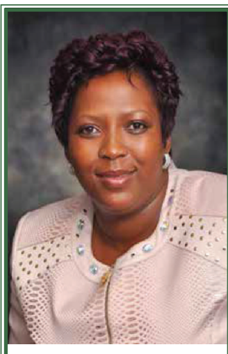
MS RM MTSHWENI MEC: DEPARTMENT OF CO-OPERATIVE GOVERNANCE AND TRADITIONAL AFFAIRS

The submission of this report is in terms of section 47(1) of the Local Government: Municipal Systems Act (Act 32 of 2000) and is at the heart of monitoring the performance of their constitutional and legislative mandate by municipalities within the province. In turn, this monitoring of performance gives effect to the constitutional imperative for municipalities to provide democratic and accountable government to local communities as envisaged in section 152(1) (b) of the Constitution. This consolidated report seeks primarily to shed light on the performance of municipalities on the five key performance areas (KPA's), and also to highlight both areas of good performance as well as areas where municipalities are facing challenges. It also enables the relevant organs of state in other spheres of government as well as other stakeholders to reflect and be able to make meaningful input on the performance of municipalities in the province and the desired improvement thereof. In the final analysis, the report seeks to provide tools for intervention and support to municipalities in those areas where they did not perform so well.