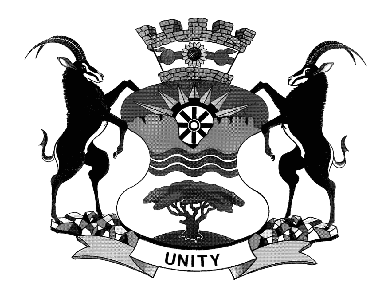
Rustenburg Local Municipality 2013 Africa Cup of Nations South Africa By-Law