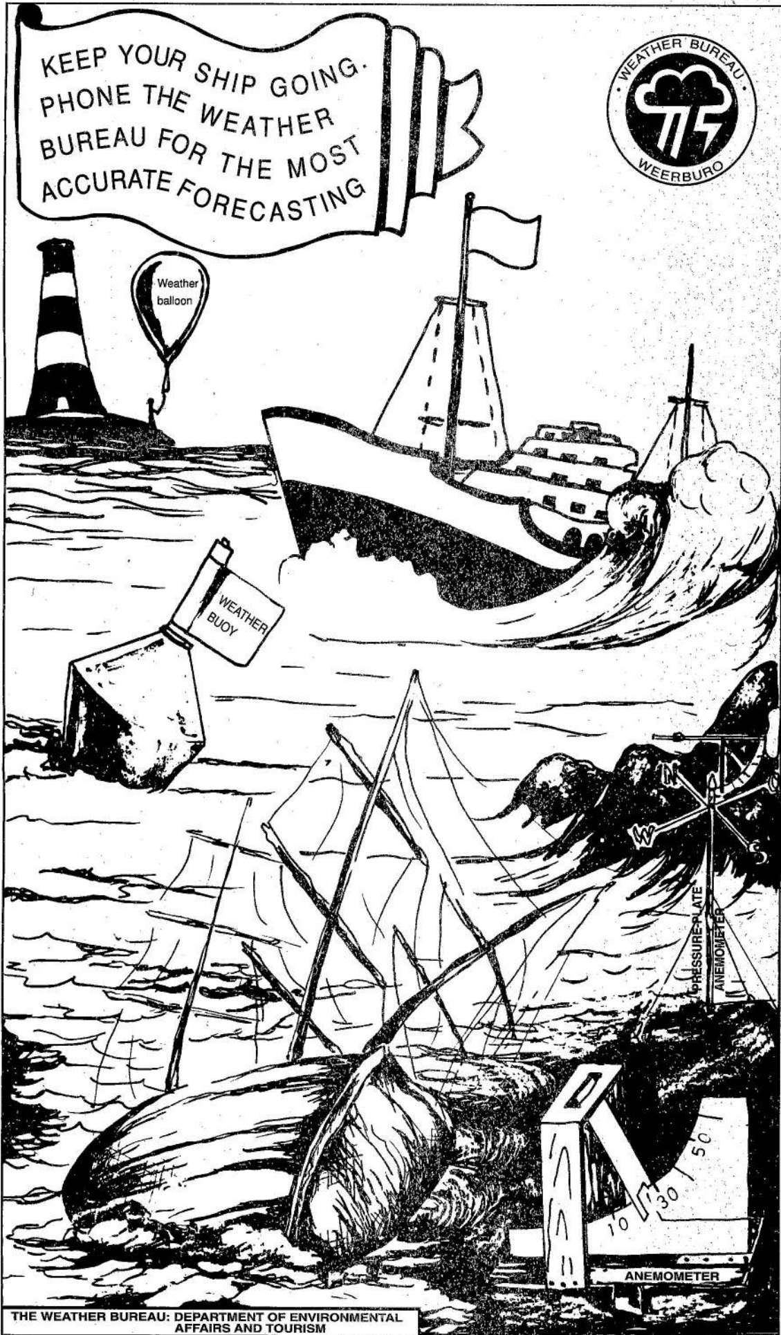
THE WEATHER BUREAU: DEPARTMENT OF ENVIRONMENTAL AFFAIRS AND TOURISM