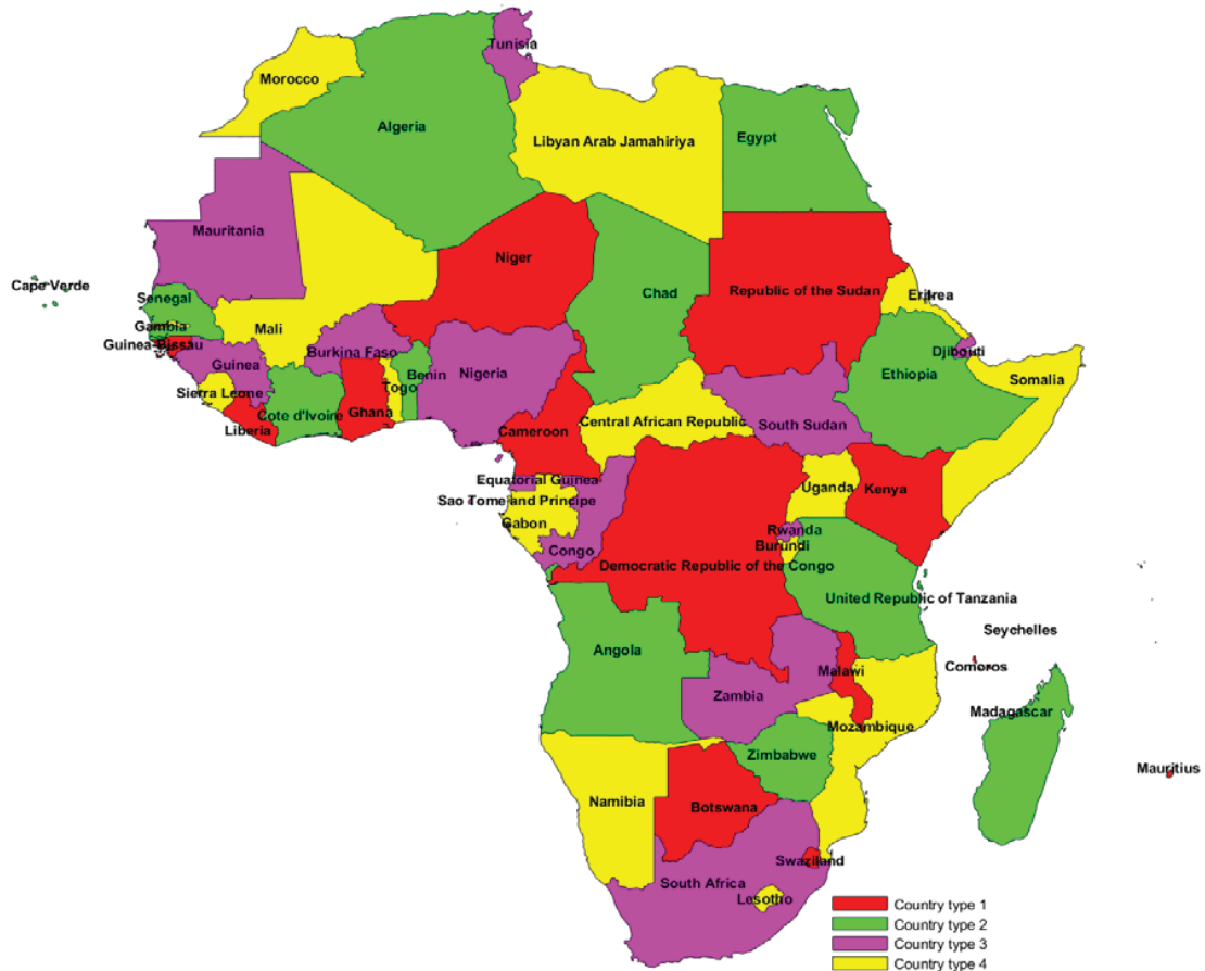
Figure 2: Country type map/PCI distribution map