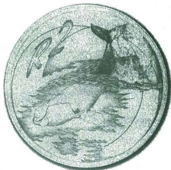
Reverse R2 Crown