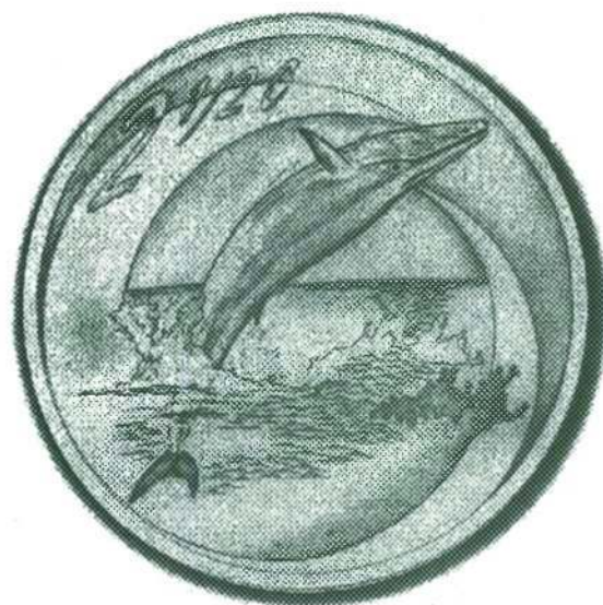
Reverse 2½c Tickey