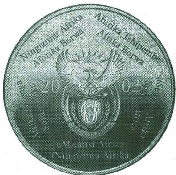
Obverse R2 Crown