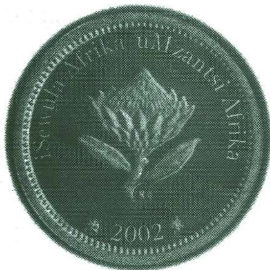
Obverse 2½c Tickey