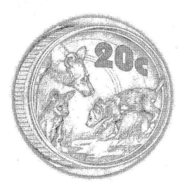
Reverse - 20c (1oz) Silver Wildlife Coln