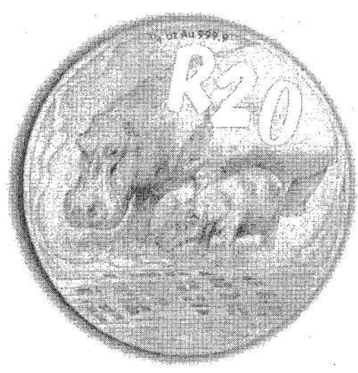
Reverse - R20 (¼ oz) Gold Natura Coin