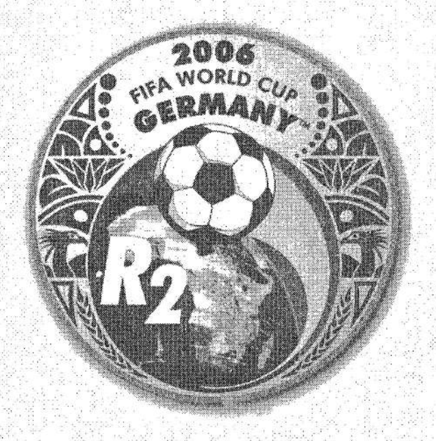
Reverse - R2 (1/4 oz) Gold FIFA Coin

FIFA WORLD CUP SERIES 2006 FIFA World Cup Germany™