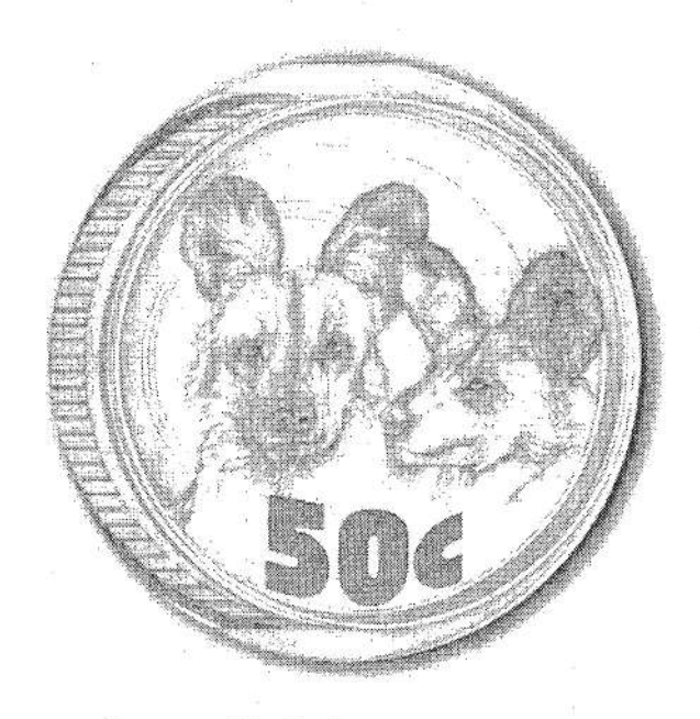
Reverse - 50c (2oz) Silver Wildlife Coin