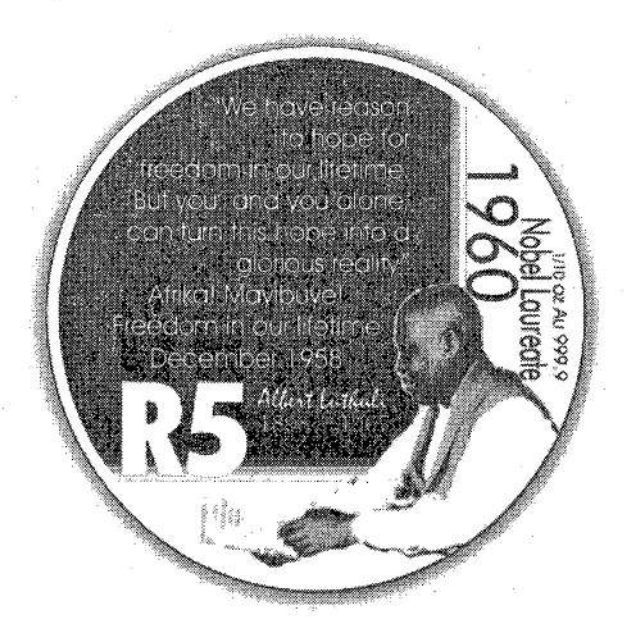
Reverse - R5 (1/10 oz) Gold Protea Coin