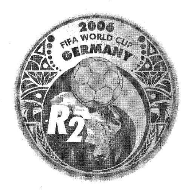
Reverse - R2 Crown Silver Coin