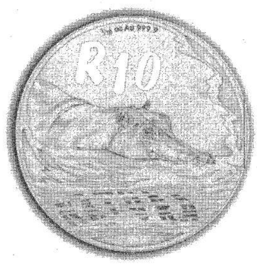
Reverse - R10 (1/10 oz) Gold Natura Coin