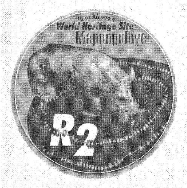
Reverse - R2 (1/4 oz) Gold Heritage Site Coin

WORLD HERITAGE SITE SERIES Mapungubwe Cultural Landscape Home of the Golden Rhinoceros