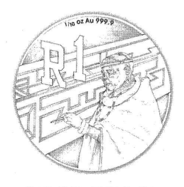
Reverse - R1 (1/10 oz) Gold Cultural Coin