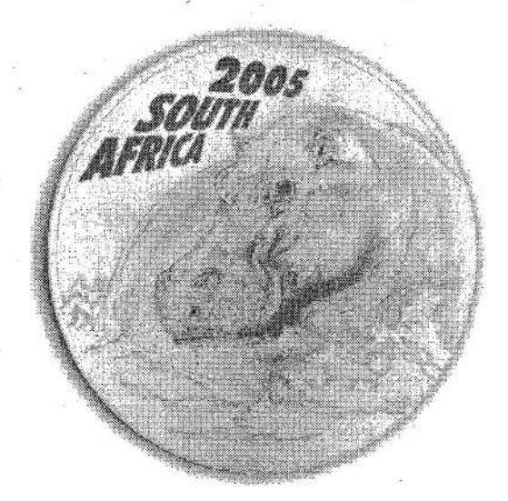
Obverse - Natura Gold Coin Series