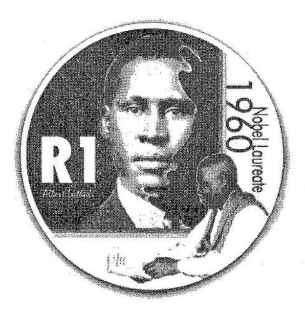
Reverse - R1 Silver Protea Coin