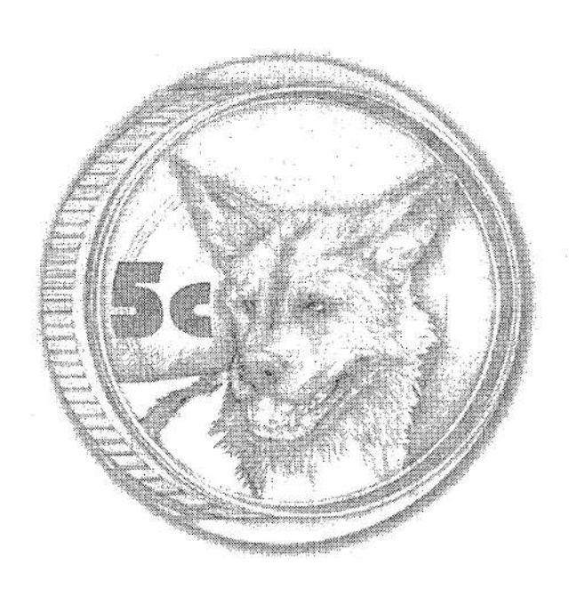
Reverse - 5c (1/4 oz) Silver Wildlife Coin