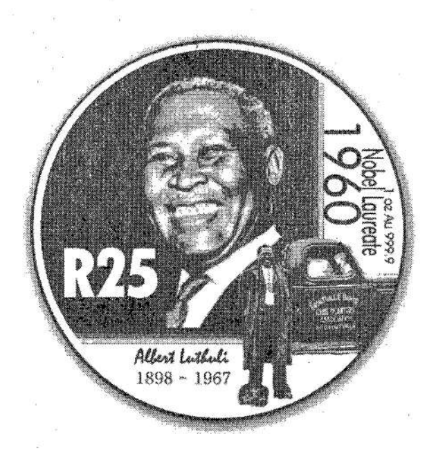
Reverse - R25 (1 oz) Gold Protea Coin