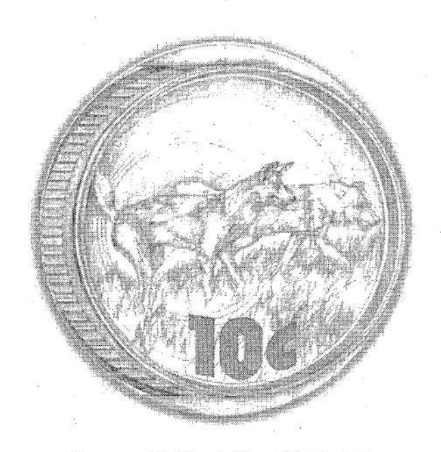
Reverse - 10c (1/2 oz) Silver Wildlife Coin