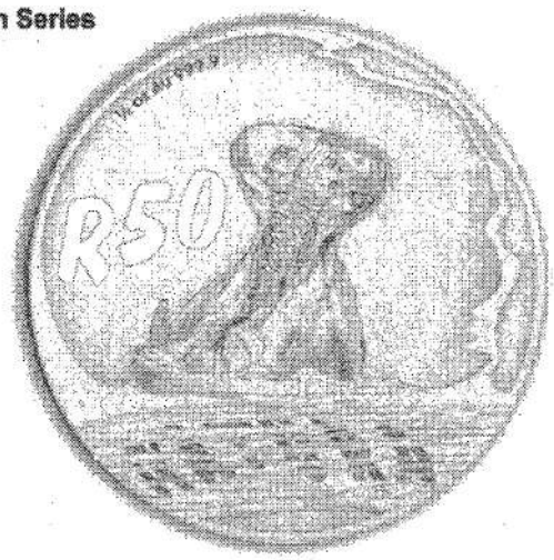
Reverse - R50 (1/2 oz) Gold Natura Coin