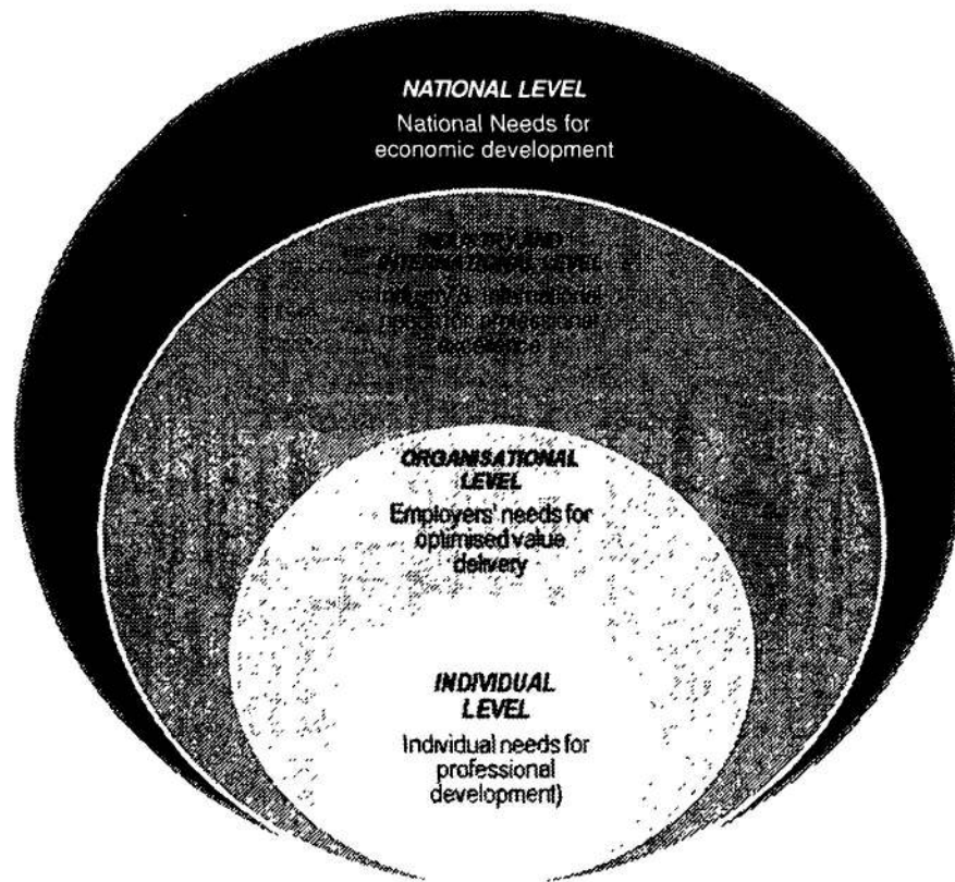
Figure 2 : Levels of development needs to be met by CPD activities