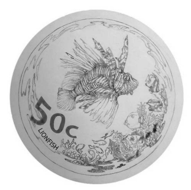
Reverse - 50c (2oz) Sterling Silver Coin