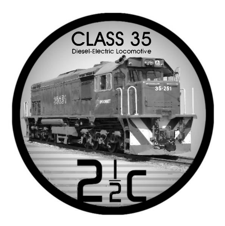
Reverse - 21/2c Tickey Sterling Silver Coin