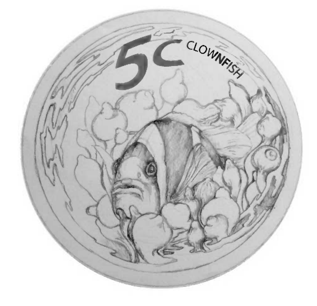
Reverse - 5c (1/4 oz) Sterling Silver Coin