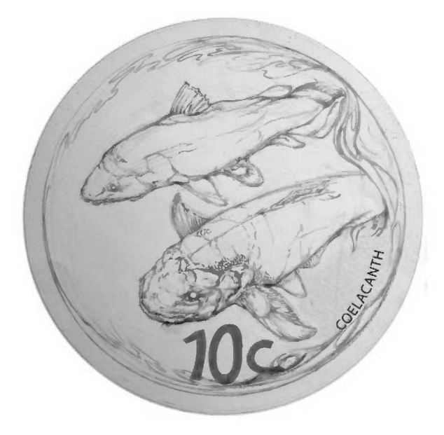
Reverse - 10c (1/2 oz) Sterling Silver Coin