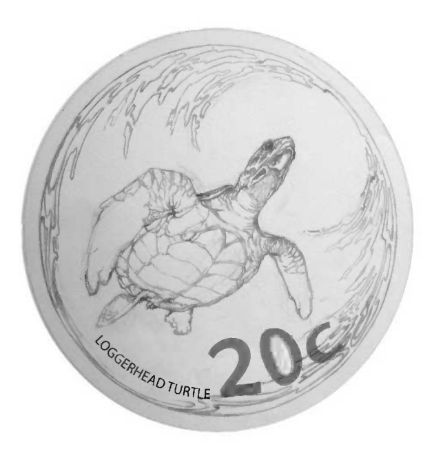
Reverse - 20c (1oz) Sterling Silver Coin