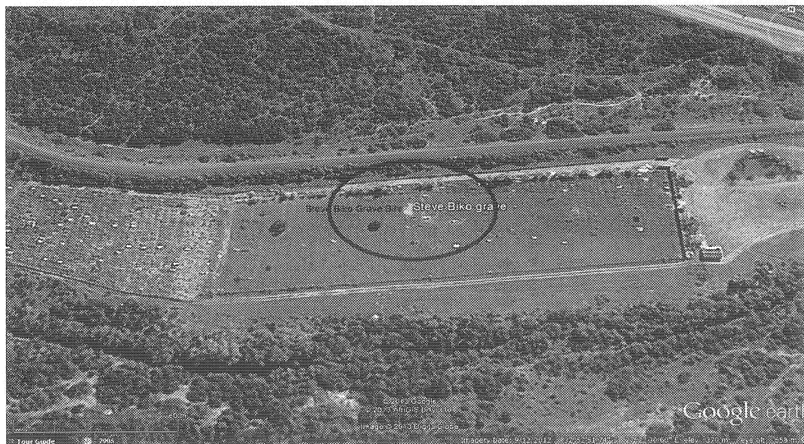
The grave of Stephen Bantu Biko in the Ginsburg Cemetery, King William's Town.