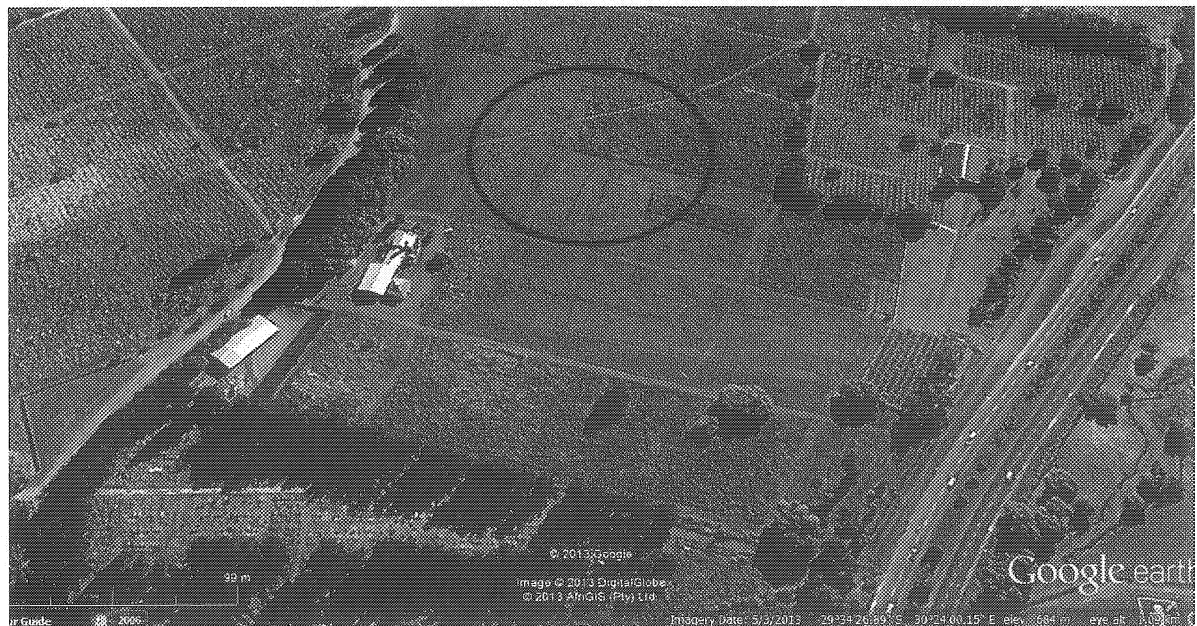
Josiah Tshangana Gumede's grave in Block T Mountain Rise Cemetery, Pietermaritzburg