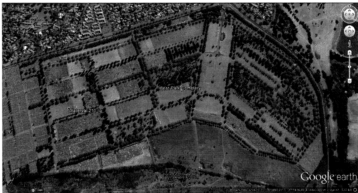
Dr. Christiaan Beyers Naude's grave in Westpark Cemetery, Montgomery Park Johannesburg.

Printed by and obtainable from the Government Printer, Bosman Street, Private Bag X85, Pretoria, 0001