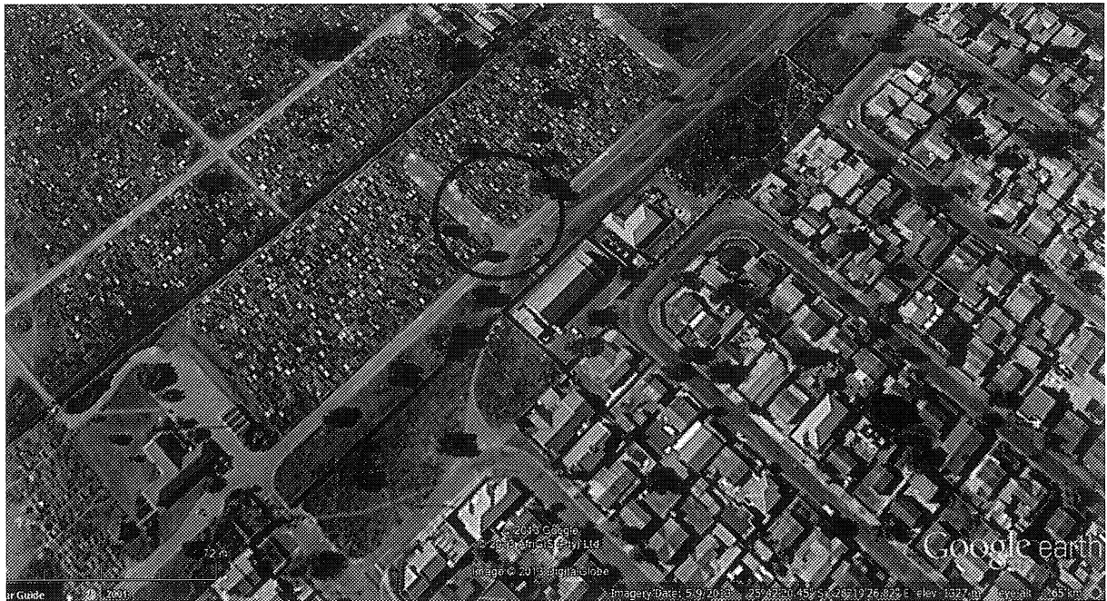
Rev. Sefako Mapogo Makgatho Mamelodi-West Cemetery.